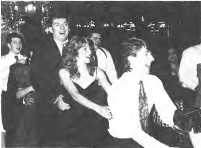
Revelers form a Conga line around the dance floor at the Tri-State Christmas Dinner Dance.