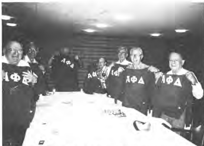
Alumni of Beta Zeta chapter at Ohio University try on Alpha Phi Delta sweatshirts at their reunion during the school's 1991 homecoming.

Alumni members of Beta Zeta chapter at Ohio University reunited at the Ohio University Inn in Athens during the university's Homecoming festivities October 11 and 12.